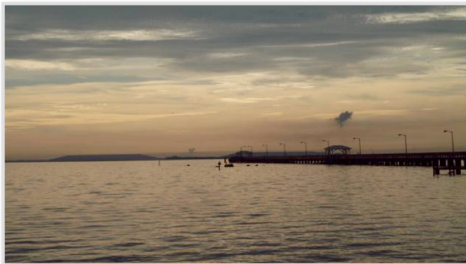
Don from Tampa sent me this beautiful picture looking over Tampa Bay. While it looks like it could be sunrise or sunset, this picture was actually taken at 10:20 AM EDT as a storm system sat off the west coast.

I've received a few pictures from observers over the last month and I'd like to share a couple of them with you: